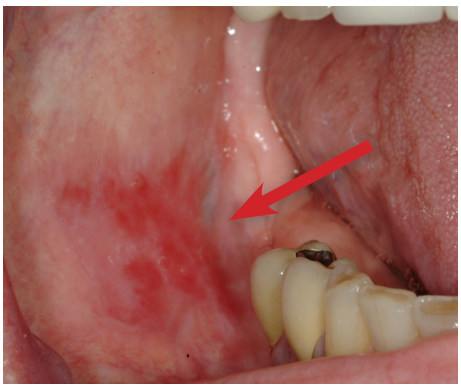
Red Ulcer (Erosive Lichen Planus)