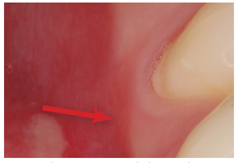
Canker Sore or "Aphthous Ulcer"

If the ulcer is the result of a disease process, it may worsen if left untreated. If it is caused by ongoing trauma, it may also worsen with time. In the rare event that it is cancer, it can lead to disfigurement or death if not diagnosed and treated in a timely manner.